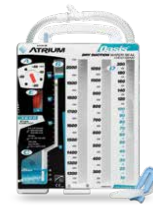
Atrium Oasis Chest Drain

* Available in single collection, dual collection, infant/pediatric, and autotransfusion (ATS) configurations.