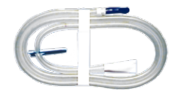
Patient Tube Pack