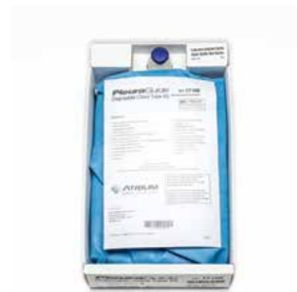
PleuraGuide Chest Tube Insertion Kit