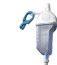
Pneumostat Chest Drain Valve