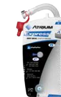
Atrium Express Mini Chest Drain